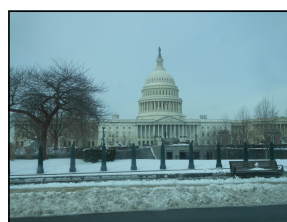
The U. S. Capitol in Snow!