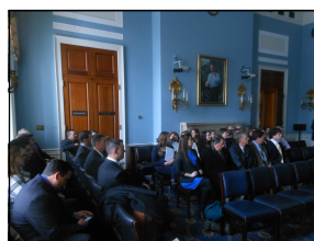
Attendees in Ag Committee Room