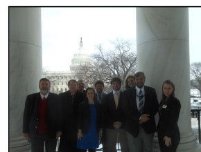
Participants outside the Capitol