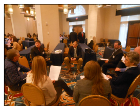
Guests work on Talking Points